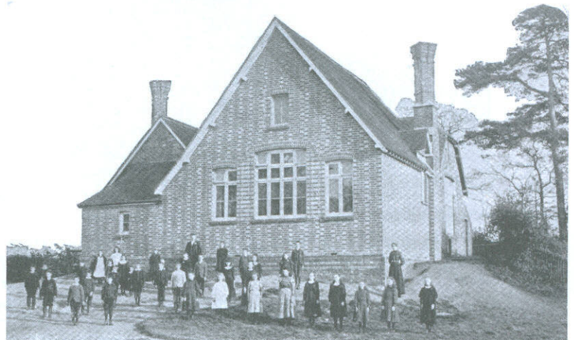
We want more! — and what's more we're going to help make it happen!

The PC is already taking steps to establish a Youth Parish Council to help guide us in addressing the needs of the younger members of our community.