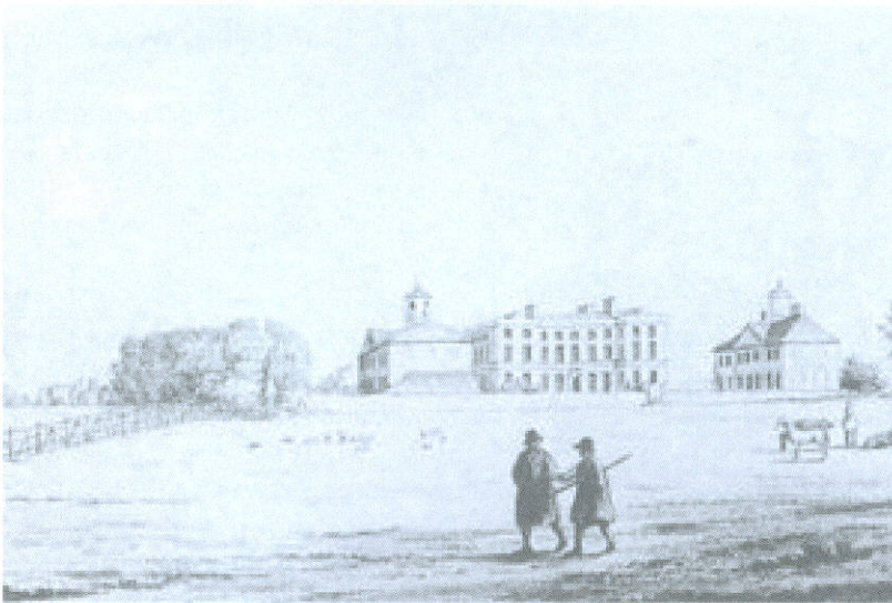
OK let me get this straight — so the Plan is to move the village back up here where it used to be and to move the big house to Uckfield — right?

The completed Plan will inform policy and direction and provide concrete evidence to support local initiatives, applications for grants, planning issues and much more.